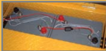
High Quality Gel Batteries No Maintenance, Refilling or Liquid Acids

Temperature Compensated Battery Charging - Prevents Overcharging and allows 5+ years estimated Battery Life.